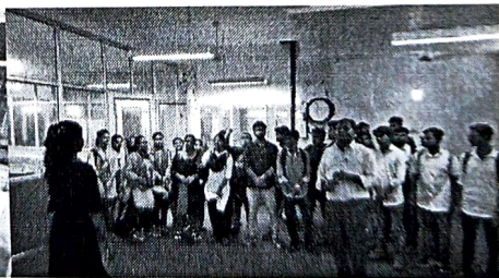
MUSIC SOCIETY AND INDOOR GAMES